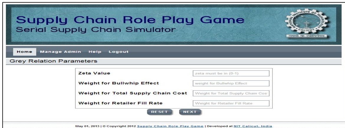
Fig.3. Screen shot of grey relation parameters

of weights for the Bullwhip effect, supply chain cost and fill rate should be 1 (give it as a decimal values). The screen shot of grey relational parameters window is given in Figure.3.