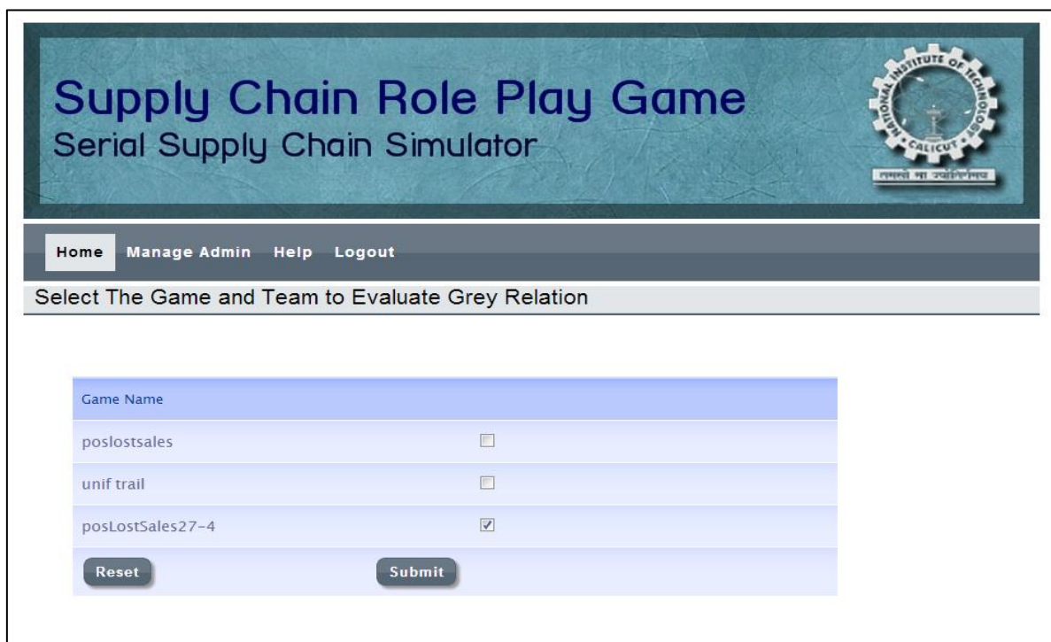
Fig.4. Screen shot of select the game to evaluate Grey Relation

After submitting the grey relation parameters, select the game from the list to evaluate grey relation. The screen shot of select the game to evaluate Grey Relation is given in Figure.4.