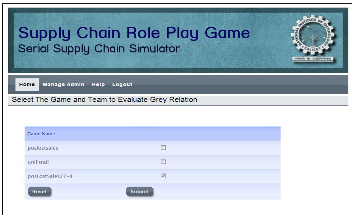
Fig.4. Screen shot of select the game to evaluate Grey Relation

After submitting the grey relation parameters, select the game from the list to evaluate grey relation. The screen shot of select the game to evaluate Grey Relation is given in Figure.4.